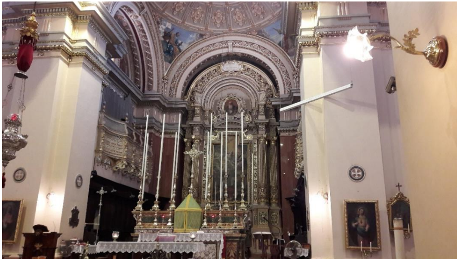
Parish Pilgrimage to Malta