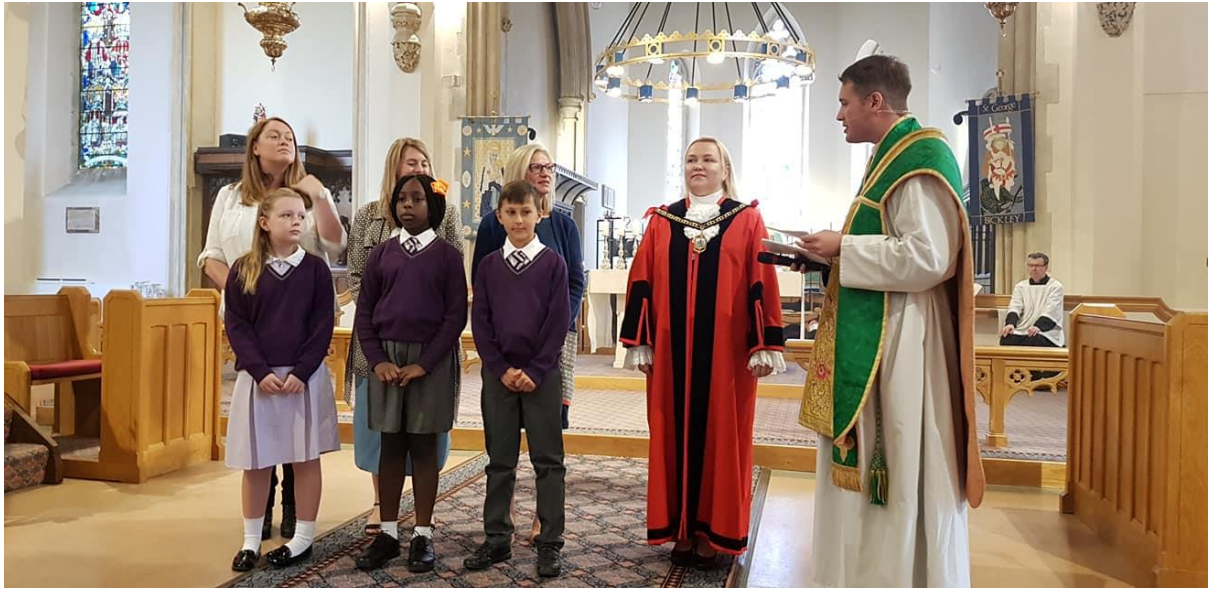
Visit by the Mayor of Bromley