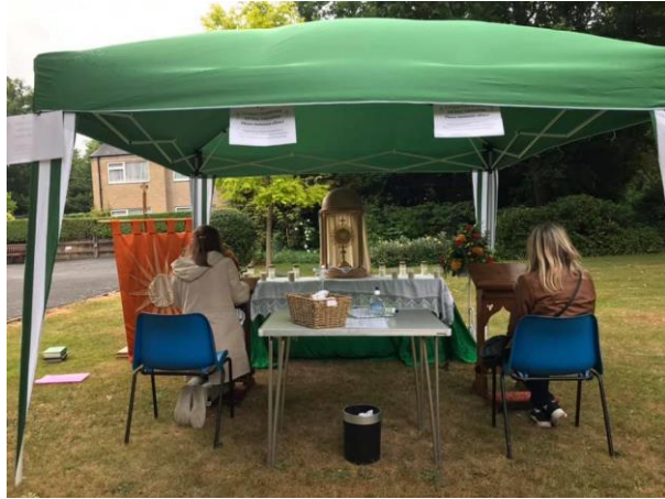
Adoration of the Blessed Sacrament on Corpus Christi in the church grounds during first lockdown