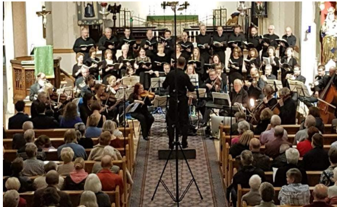
Sine Nomine Concert