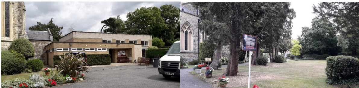
The Church Hall

The Choir Vestry is now also used as a small hall and is available for hire.