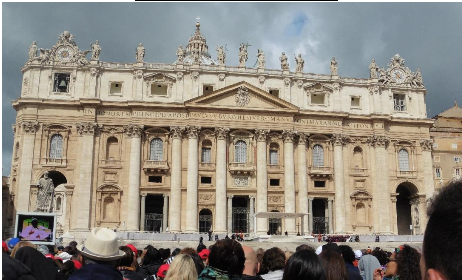
Parish Pilgrimage to Rome