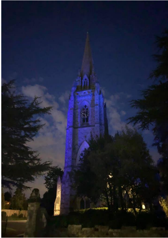
Tower lit in blue in support of the NHS during first lockdown