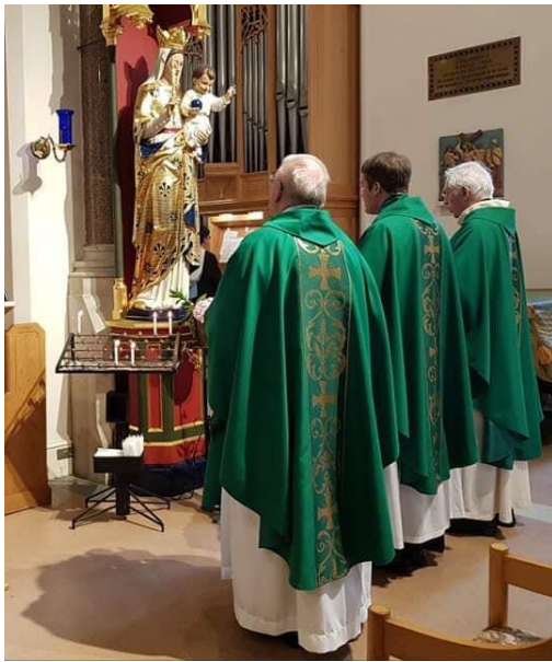
Reciting the Angelus