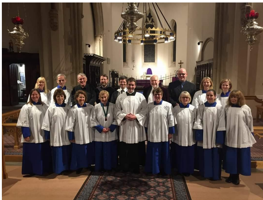
St George's Choir

Our choir ordinarily comprises around eight singers, although this number increases significantly for special services. Under the supervision of our Director of Music, the choir rehearses twice weekly, and sings on Sundays and for festivals (including every day in Holy Week). Choral Evensong is typically sung two or three times each year. For Christmas 2020, we partnered with the choir of St Giles, Farnborough for two services of Nine Lessons & Carols. The church is also used by various choirs and other ensembles for concerts.