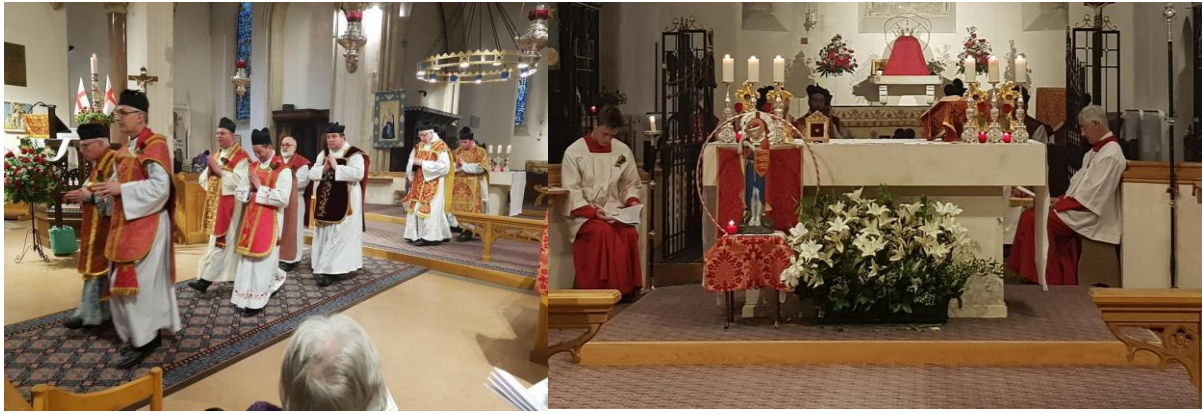
St George's Day