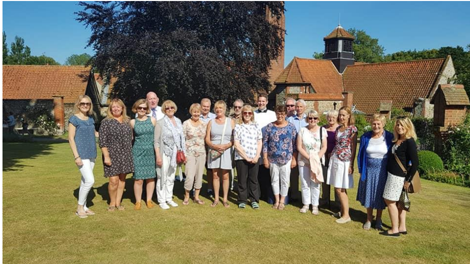
Parish Pilgrimage to Walsingham