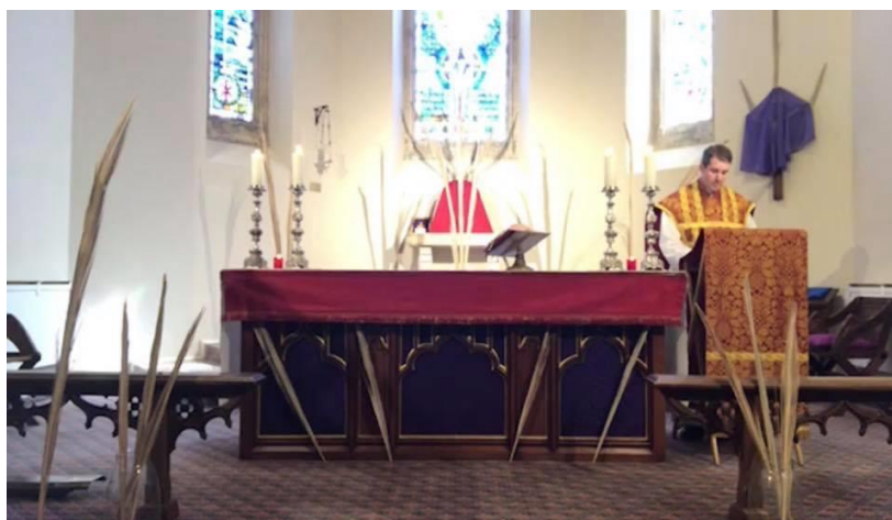
Palm Sunday live-streamed during the first lockdown

During the three periods of lockdown instigated because of the COVID-19 pandemic, St George's adapted to a mix of online and in-person worship, live-streaming Masses via our Facebook Page, and uploading videos for our own Children's Church and to support Collective Worship in local schools.