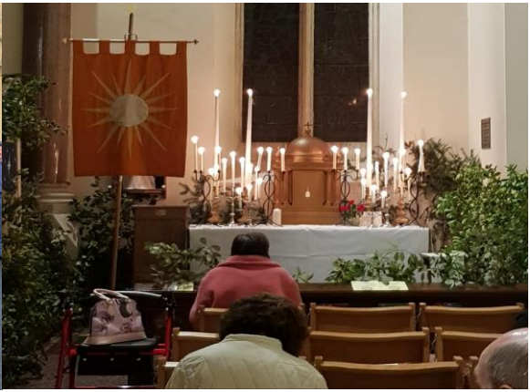
Maundy Thursday Watch