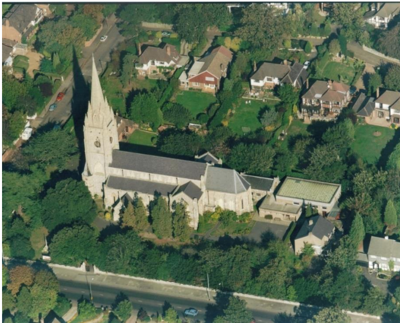
Aerial view of the church

The church is open every day from around 8.00am to 6.00pm.