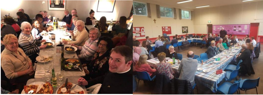
Dinner after a visit to Westminster Abbey