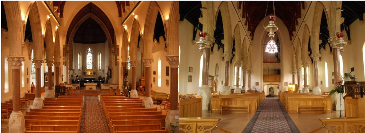
The interior of the church